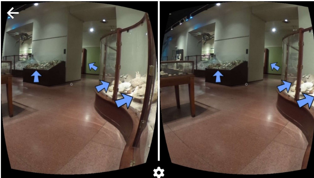
Figure 1. Stereoscopic view of the virtual reality field trip as displayed in Google Cardboard.

The in-person field trip and VRFT were of a natural history museum located at the participants' university campus. Prior to conducting the study, all four floors of the museum were captured using a Ricoh Theta S 360-degree camera. We designed a custom VR tour of the museum (Authors, 2017) where participants could move through the museum by looking at arrows and pressing the button on the top of their Google Cardboard (see Figure 1.) This study took place over a period of 3 weeks, with each week representing one portion of the before-during-after field trip sequence (see Table 2).